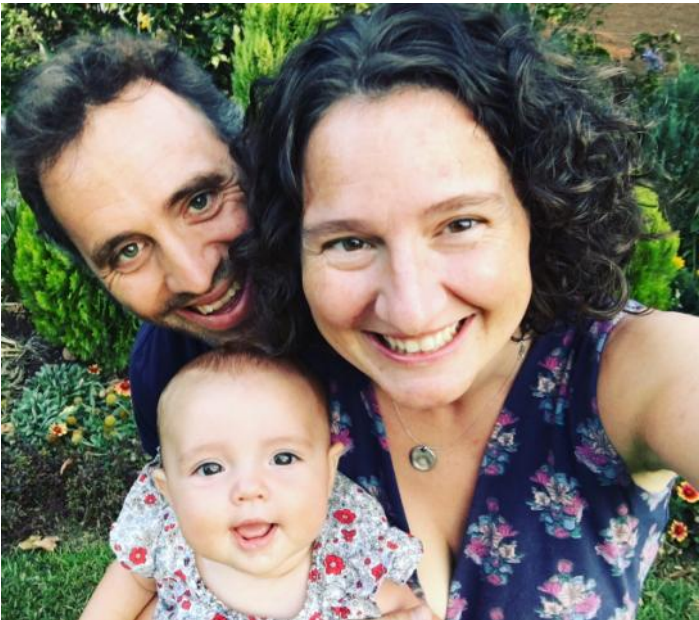
11/15 The Lytle family at a garden center near their house