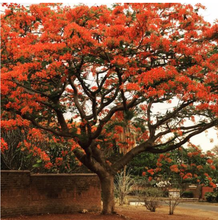
11/15 A gorgeous flame tree near the Lytles' home

main dish here is considered the relish). We are about to come up on the rainy season which is the worst time for malaria and also a hard time for Malawians because usually the food gets much more expensive and scarce (they are having to use the last of the stored food before the harvest is ready at the end of the rainy season). I have heard that crime increases during this period so I am hoping we can stay safe both from malaria and crime. On the upside, it is supposed to become much more beautiful because all of the plants spring back to life and start growing and blooming. We are in the Southern Hemisphere here, so it's getting to be the warmest time of the year." We will be learning more about Malawi as the year goes on. Please keep the Lytle family in your prayers.